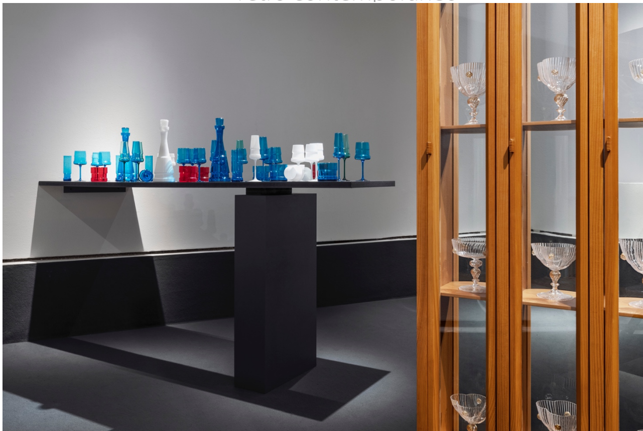
Exhibition view with Mosquito and Quadrifoglio